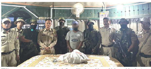
Imphal, May 4:

In two separate operations, Tengnoupal and Moreh Battal-ions under the aegis of IGAR (South) foiled cross border narcotics smuggling in Khudengthabi and Moreh on