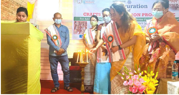
IT News Imphal, May 4:

The Wood and Wooden Home Furnishing Crafts Programme was held on April 23 to April 29 at Khurai Sajor Leikai, Imphal East, Manipur That Programme was held for Seven days. It was organized by Luwangpokpa Women Welfare Association, Khurai Sajor Leikai, Imphal East un-der the sponsorship of Office of the Development Commis-